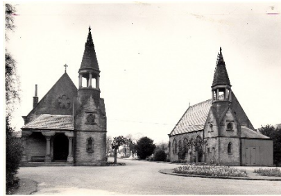
South and North Chapels 1966

In 1878 the Ilkley Cemetery was opened near the river on Cemetery Road (now called Ashlands Road). The new cemetery was built on 13 acres of land with two chapels, one for Anglicans on consecrated ground and one for Non-Conformists and Catholics which was un-consecrated. The plan below shows these different areas of the Cemetery.