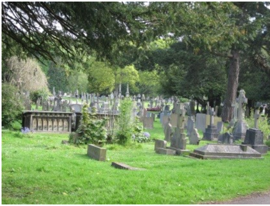
Catholic Section F