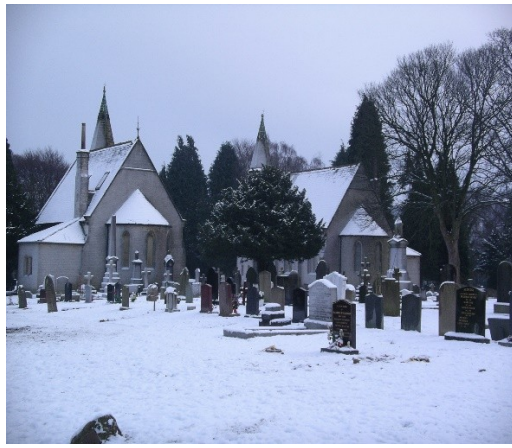
Non-Conformist Section A